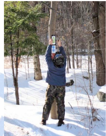
A trail mark trouble spot gets new signs to guide the riders. The confusion at Greenwater Pond is no longer!

needed. I discovered a very durable material that makes weatherproof self sticking signs in a laser printer. Over a year of testing proved they are quite durable. Since they are so much easier to make than the original laminated intersection signs, and stick better too, I designed a system of trail numbering. These round blue KTSR shields are popping up all over the trail system.