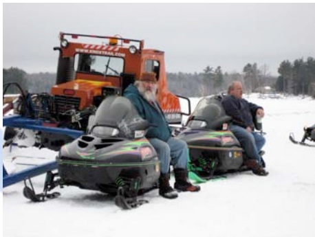
The Bombi and Thiokol Groomers were on display at the Poker Run

We all have very busy lives outside of the club, but when help is asked for, everyone steps up and we get things done!!! There is