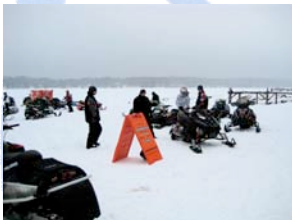
New Boston Crane was on hand to demonstrate their newest sleds

The course led riders to 4 checkpoints where tokens were picked up. A bonus checkpoint got an extra card. The winning hand was 4 eights.